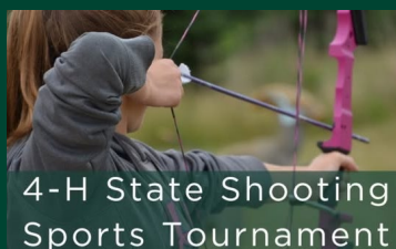
4-H State Shooting Sports Tournament